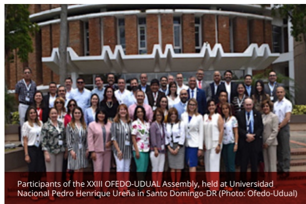
Participants of the XXIII OFEDO-UDUAL Assembly, held at Universidad Nacional Pedro Henrique Ureña in Santo Domingo-DR