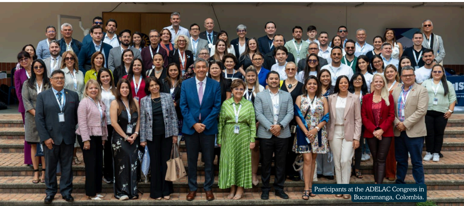
Participants at the ADELAC Congress in Bucaramanga, Colombia.