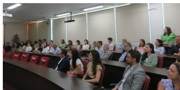
Inauguration ceremony of the Sensory Dental Room at FOUSP.