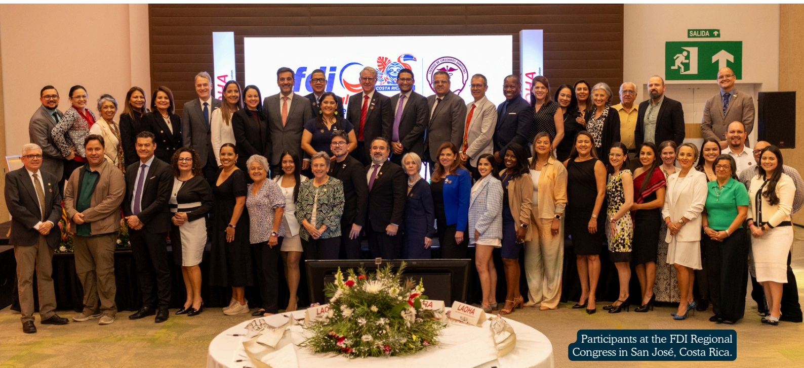
Participants at the FDI Regional Congress in San José, Costa Rica.